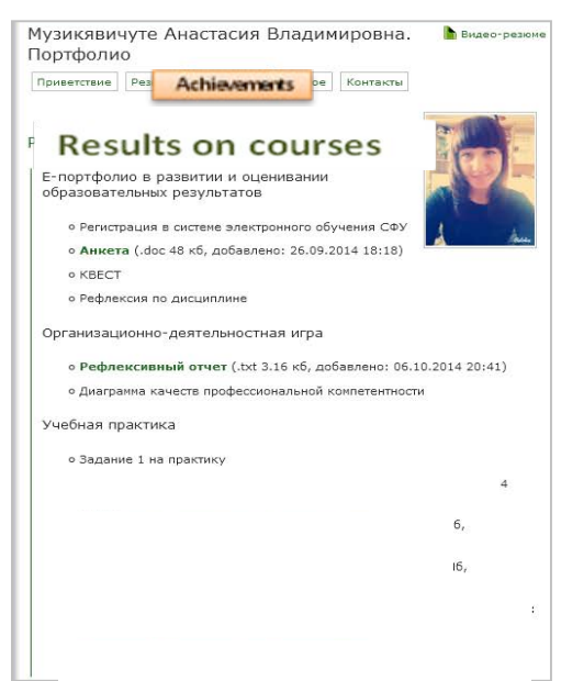
Pic. 3 Example of the published results of the training made by the freshman –future teacher in the personal ePortfolio on the web-site of the Institute of Educational Science, Psychology and Sociology, SFU

The next event in the practice-oriented training of freshmen was the concentrated training in educational institutions. The results of that training future primary school teachers reflected in individual diaries, in the analysis of design and implementation of their subject and extra-curricular activities with pupils, in photo reports. Students published their materials on the training in personal ePortfolios on the website of the Institute of Educational Science, Psychology and Sociology, SFU [6]. The example is on the pic.3.