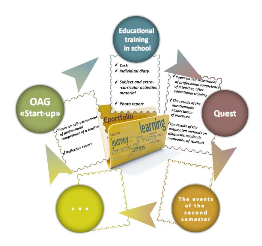
Pic.1 Model to strengthen the practice-oriented training of future teachers in the framework of the measures for the approval of new modules.