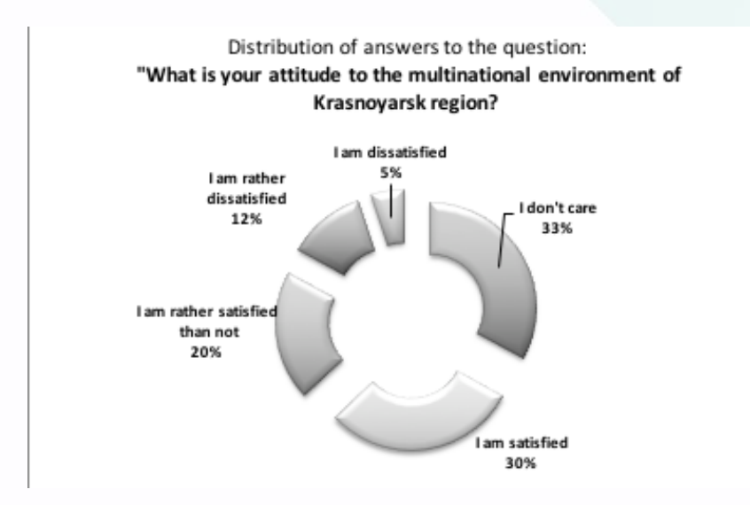
Chart 2 - Distribution of answers to the question: "What is your attitude to the multinational environment of Krasnoyarsk region?

Satisfaction with living in a multinational society is mostly caused by the favorable living conditions and social environment of Krasnoyarsk region. People suppose that division on the national basis is incorrect, that all the nations should have equal rights and that interethnic communication enriches culture and introduces people to the traditions of the other nations.